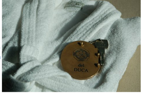
Castello di Monterone, Perugia, Umbria (Italy)