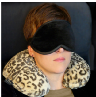
Bucky my favorite travel neck pillow (get the fuzzy eye mask too!)