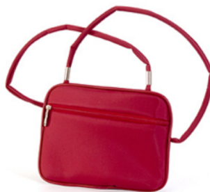
"GROOM bag": I found this small shoulder bag (made of black nylon microfiber) in a boutique on the Left Bank in Paris. Light as a feather — perfect for day or night.