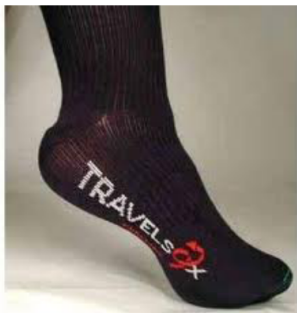
TravelSox: compression socks prevent swollen ankles on long flights