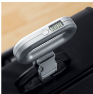
Digital Luggage Scale: I don't actually own this (yet) but it's a great way to eliminate overweight baggage charges!