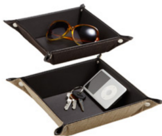
"Vide-poche": keep track of small items on your bedside table in the stylish French way!